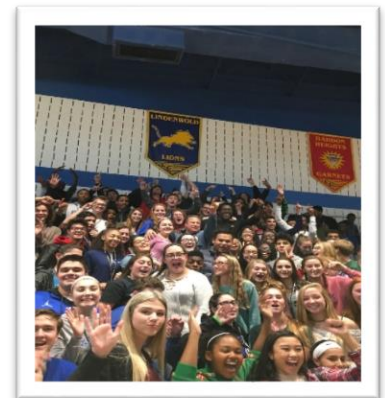
Class of '81 and Class of '18.