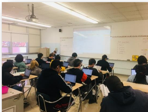
Students using their 1: 1 devices in class

In addition to the 1:1 initiative, Sterling has been rebuilding and improving the school's infrastructure (updating access points, adding storage, and managing servers) which is extremely expensive. With these updates, broadcasting will run much more smoothly than ever before in Sterling. In the future, you can expect there to be more upcoming updates, such as updates to the TV Studio and better production. The 1:1 initiative is also almost complete, and soon all students will have a tablet that they will be able to use at home and during the school day.