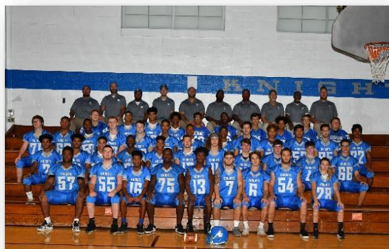
Sterling Varsity Football Team