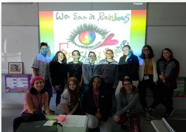
Members of the GSA Steering Committee

It is through these goals that Sterling High School now means to shed light and much needed support to its LGBTQ+ students. Often neglected in most education curriculums, thus aiding in insensitivity and bullying, the Sterling Gay Straight Alliance will pick up the slack through informative PSAs, social gatherings that sustain an environment of acceptance and understanding, and by preaching its diverse message of "I am Me." It implores students to join together instead of favoring rifts and inequalities amongst themselves and is always accepting of new members whilst remaining confidential to ensure their priority, which will always be safety.