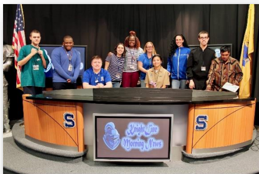
Students in the MD Program