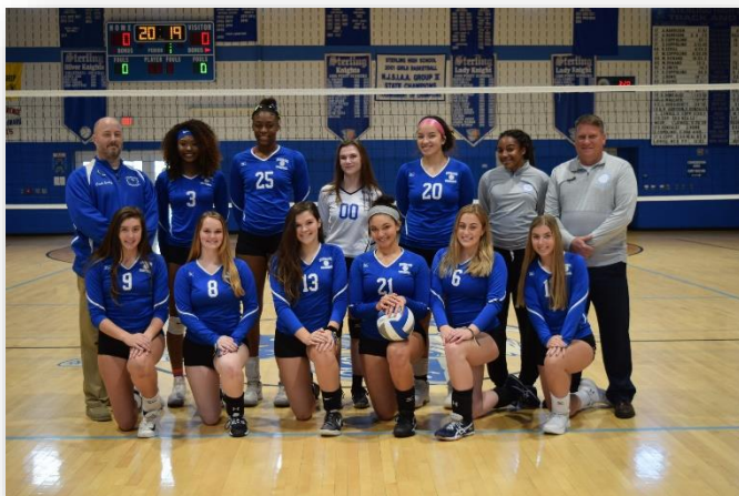
Sterling Varsity Volleyball Team