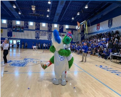
Sir-Wins-A lot and the Phnanatic share an embrace

Special thanks to the hardworking advisors, class officers, and student government officers who work tirelessly during this week. All in all, spirit week is a fun, exciting week anticipated by all students.